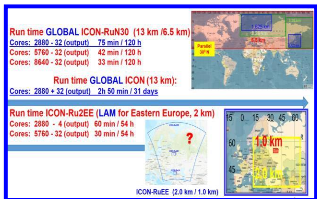
Fig. 3. System COSMO-Ru with configurations ICON-Ru (global and regional (LAM)) on the Cray XC40-LC “Roshydromet”.

Figure 3 shows the domains of integration including the nested ones and the results of numerical experiments with different numbers of cores made for choosing optimal configurations. A 5-day forecast by the global ICON model with nesting (a grid step of 6.5 km to the north of 30°N and 13 km for the rest of the region, 90 vertical levels up to 75 km) requires 42 min of processor time using 5760 cores for computations and 32 cores to organize the input / output process.